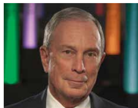
Michael Bloomberg has contributed $1bn to anti-smoking campaigns

There is little evidence for increasing smokers in lower-income brackets offsetting the decline of smokers in higher income brackets in the developed world, given that smoking rates are declining across the developed world. This