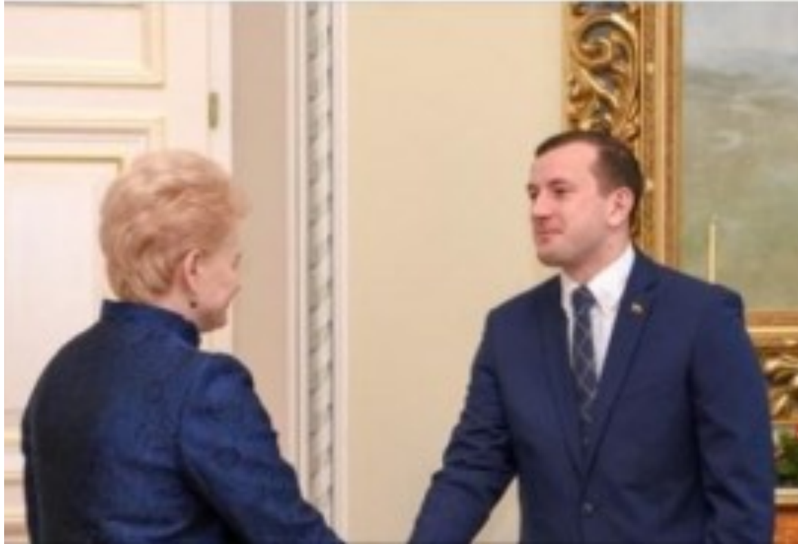
Virginijus Sinkevičius, Minister of Economy of Lithuania MA in European Studies 2012-2013