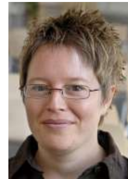
Dr. Zeiss Science & Technology